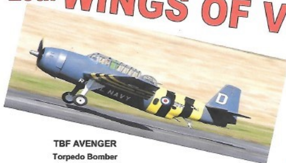
TBF AVENGER Torpedo Bomber (Kellogg Kit)

Aircraft must be in appropriate warbird colors