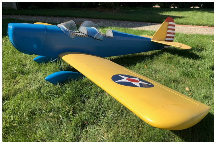
SIG 25% Spacewalker. Finished, but appears to have never been flown. Slight hangar rash. $125