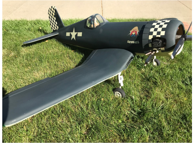
Built-up Corsair. Enya .90 four stroke with Perry pump. Retracts. Some minor damage. Probably needs some RC updating. $175