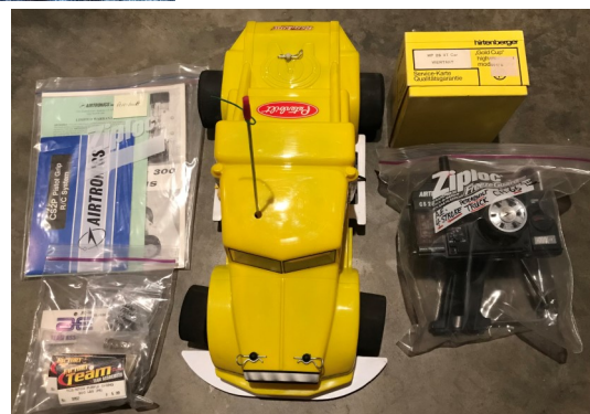
"Peterbuilt" on Associated chassis. HP .25 FOUR stroke and Airtronics radio, ready to run: $150