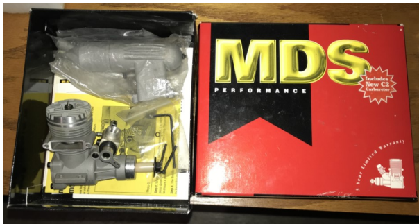
(two) MDS .40 engines with mufflers. New In Boxes: $40 each More engines for sale!