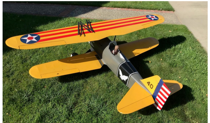
Curtiss Hawk P6E. Built from Hostetler plans. 84" span. Kioritz 40cc gasser. Extra FG cowl. Probably needs some updating: $275