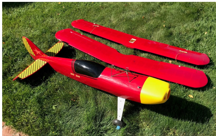
SIG Skybolt. Almost finished, never flown. Fair condition. $50

All the built-planes will require some TLC, RC and fuel system updates. These were built by an experienced RCer, but had been sitting in his shop for years. There are several framed-up aircraft, complete and partial kits. Engines, tools, hardware and small items and even FREE STUFF!