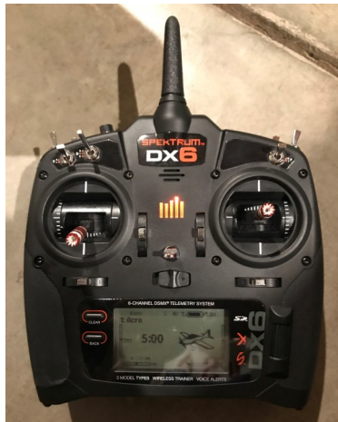
Spectrum DX6 DSMX Transmitter LIKE NEW: $150