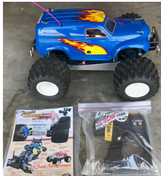
OFNA "Pirate" Monster truck w/Rossi .21 and radio. Perfect condition: $200