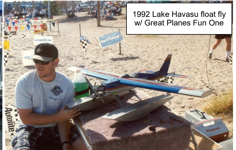
1992 Lake Havasu float fly w/ Great Planes Fun One