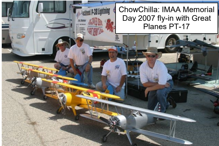
ChowChilla: IMAA Memorial Day 2007 fly-in with Great Planes PT-17