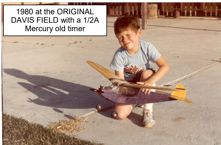
1980 at the ORIGINAL DAVIS FIELD with a 1/2A Mercury old timer