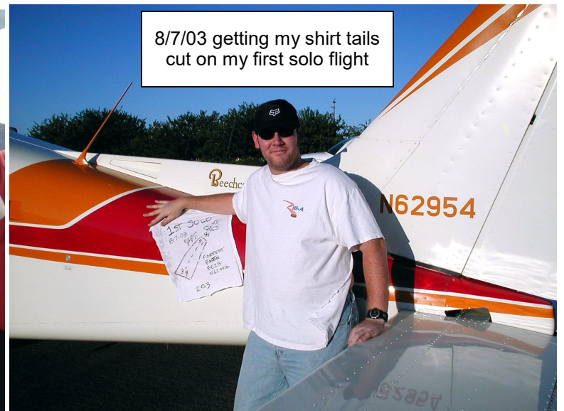
8/7/03 getting my shirt tails cut on my first solo flight