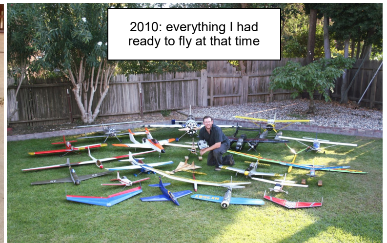
2010: everything I had ready to fly at that time